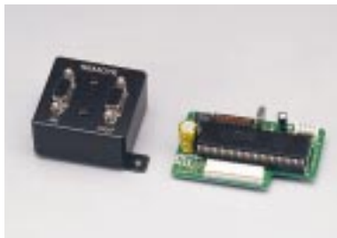
BKM-103 Serial remote control kit for RS422A