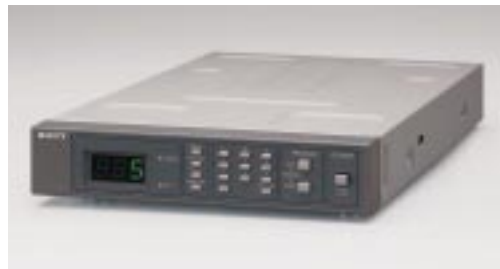
TU-1040E Tuner unit