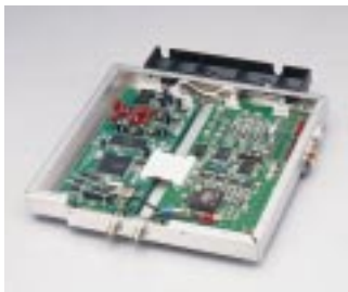
BKM-101C/102 Component serial digital interface kit 101C (video) / 102 (audio)