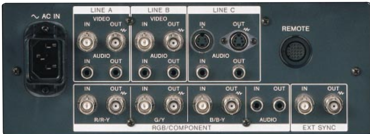
Rear Panel Connector Section