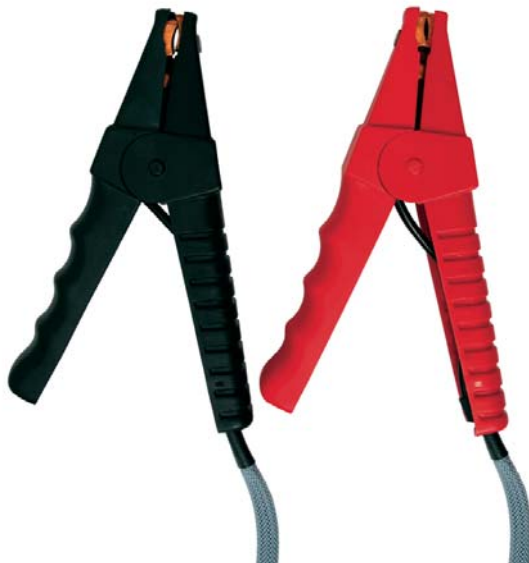
Kelvin clips, set of two, (10A) 10 ft Catalog #1017.84