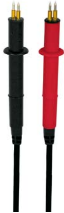
Kelvin probes, set of two, spring loaded (10A) 10 ft Catalog #1017.82 (1A) 20 ft Catalog #2118.52