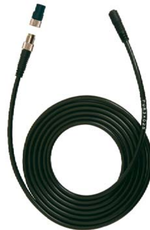
RTD Temperature Probe with 7 ft extension cable Catalog #2129.96