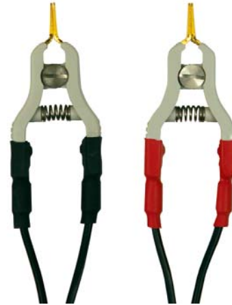
Kelvin clips, set of two, (1A) 10 ft Catalog #1017.83