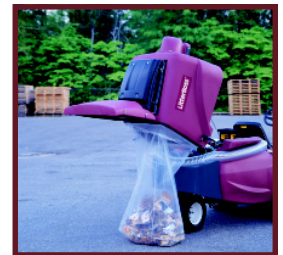
Litter disposal is quick, simple and neat.