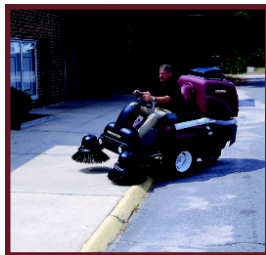
With it's 9 inch curb clearance, the LitterBoss moves from street to sidewalk with ease.