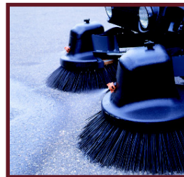
When needed, spray jets mist the surface before sweeping to control dust.